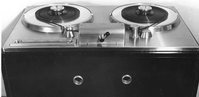
Fig. 4. Model 200A

Ampex delivered the first production Model 200A in April, 1948, to Jack Mullin; the second recorder followed a few days later. Jack used serial numbers 1 and 2 for recording the Bing Crosby Show. Many of the rest of the first production run of 20 went to ABC in Chicago where they were used mainly for broadcast time delay. This was a revolutionary change for the