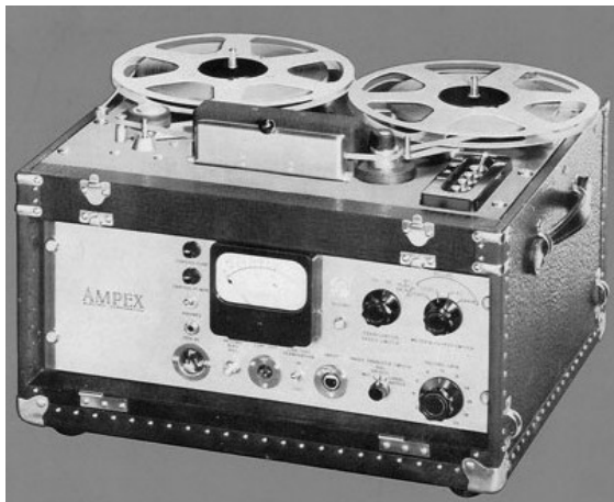
Fig. 7. Model 400A Portable