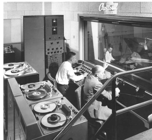
Fig. 6. Models 200A and 300 in Use, Capitol Records

By early 1949, the financial situation for Ampex had improved considerably as a result of shipments of the Model 200A and Model 201 conversion kits. Alex was now able to do something he had wanted to do for some time: hire Walter Selsted.