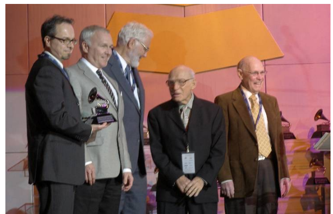
Fig. 13. Emmy Award Ceremony—February 9, 2008