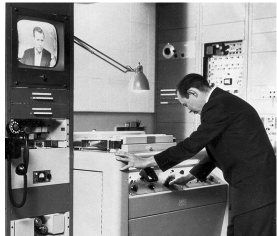
Fig. 11. CBS News Anchor Douglas Edwards